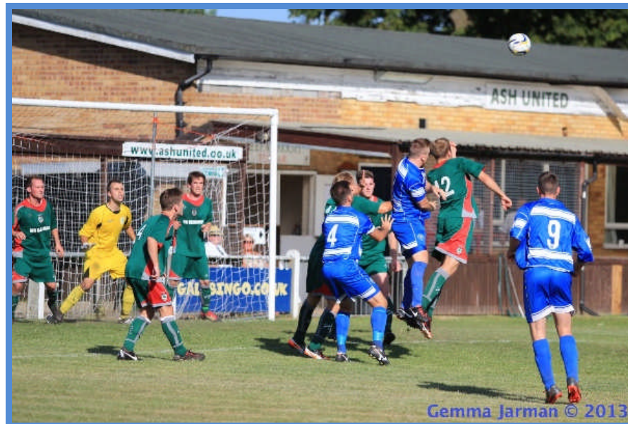
Above: Goal mouth action at the Ash game on Saturday 31 August